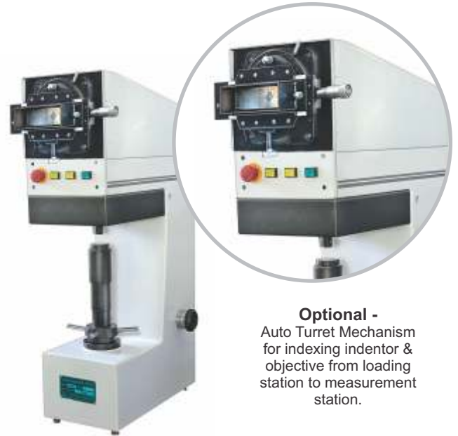
Optional - Auto Turret Mechanism for indexing indenter & objective from loading station to measurement station.

For Auto Turret Machine after clicking on cycle start button indexing mechanism will operate automatically & loading mechanism starts, once loading finishes again indexing mechanism will positioned at measuring station.