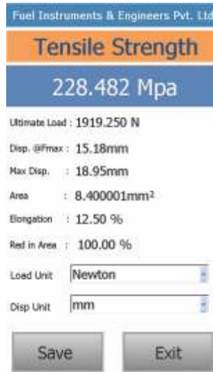
Test Result Display