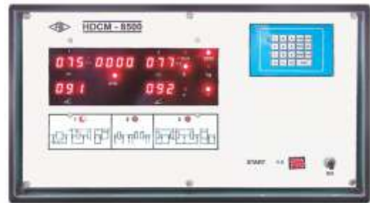
HDCM 8500 Panel